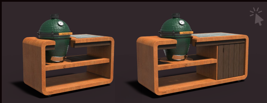
KAMADO STATION 1500 & 2000 CORTEN STEEL