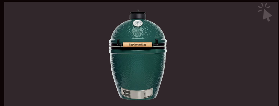
BIG GREEN EGG LARGE